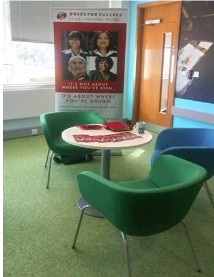
All set up at Job Centre to promote Dress for Success