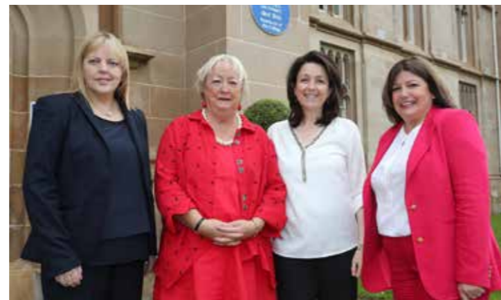
Photo: Foyle Family Justice Centre Conference: From Hurt to Hope (June 2019)

Total Number of Referrals to Floating Support: