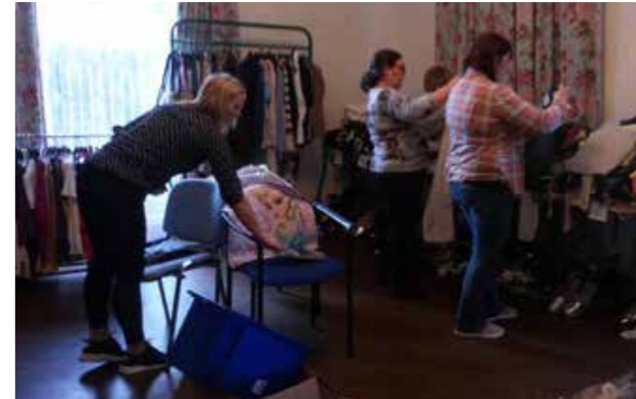
Volunteers helping set up the Dress for Success Pop-Up Shop