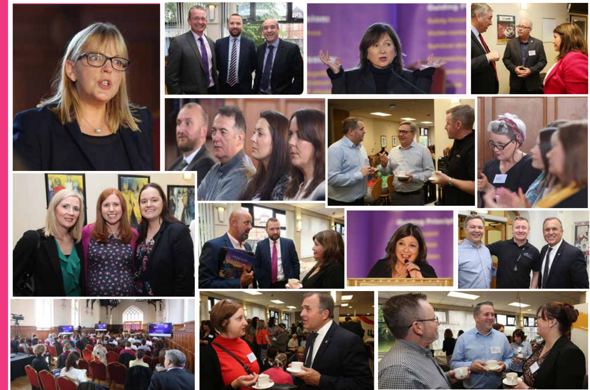
Photos: Foyle Family Justice Centre Conference: From Hurt to Hope (June 2019)