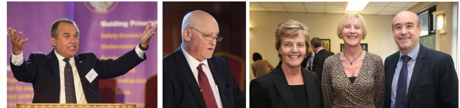
Photo: Foyle Family Justice Centre Conference: From Hurt to Hope (June 2019)