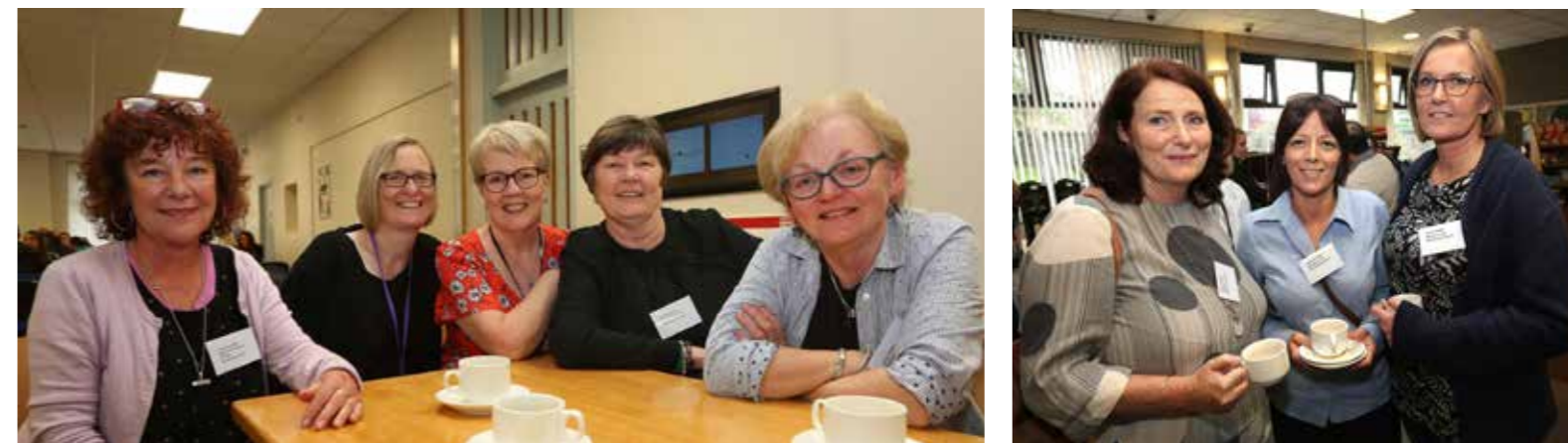
Photo: Foyle Family Justice Centre Conference: From Hurt to Hope (June 2019)

Our principal funders are Supporting People and we have received continued funding from the Big Lottery, Western Health & Social Care Trust and Probation Board NI. The funding we received has enabled Foyle Women's Aid to provide the services, staff and resources required to meet the aims and objectives of the organisation.