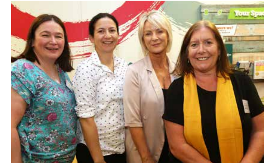
Photo: Foyle Family Justice Centre Conference: From Hurt to Hope (June 2019)